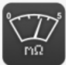
Battery Resistance Meter

BATT/PROGRAM → MAIN 12.54V → 4.18 4.18 4.18 U BATT METER → H: 4.181V L: 4.179V → 0.00 0.00 0.00 U