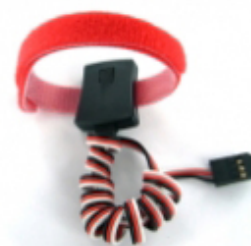
* Temperature Probe SK-600040

*This function is available by connecting optional temperature probe, which is not included in the package.