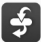
Program Data Store/Load

SKYRC B6 AC+ V2 employs an individual-cell-voltage balancer. It isn't necessary to connect an external balancer for balance charging.