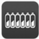
Lithium Battery Balancer

SKYRC B6 AC+ V2 employs an individual-cell-voltage balancer. It isn't necessary to connect an external balancer for balance charging.